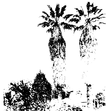
Historic "Twin Palms", moved from the Palm Springs area to Wilson Ranch 100+ years ago. Still located at the rear of the 1541 Cambridge Road home.