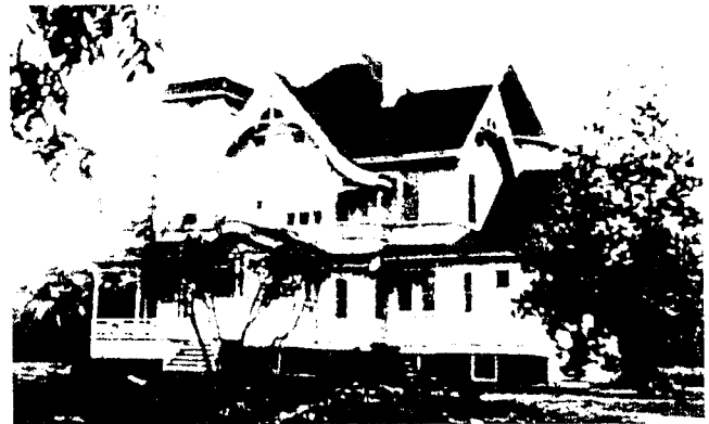
The Mayberry House-1922. Located at the corner of Oak Knoll Avenue and Monterey Road, it was San Marino's first City Hall and school from 1913-1923